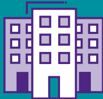
Attract New Investment