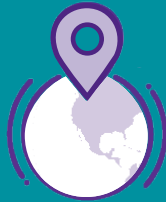
Market Snohomish County

Economic Alliance Snohomish County exists to be a catalyst for economic vitality resulting in stronger communities, increased job creation, expanded educational opportunities, and improved infrastructure.