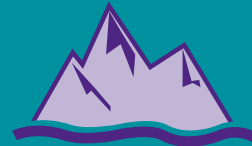
Improve Quality of Place