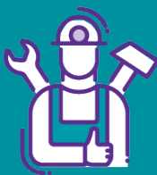
Respond to Employer Needs