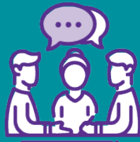
Connect Regional Leaders